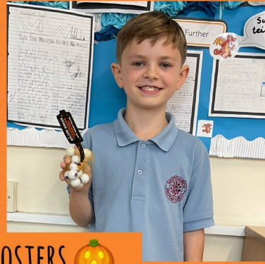
PUMPKIN POSTERS 🎃