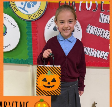
PUMPKIN CARVING 🎃