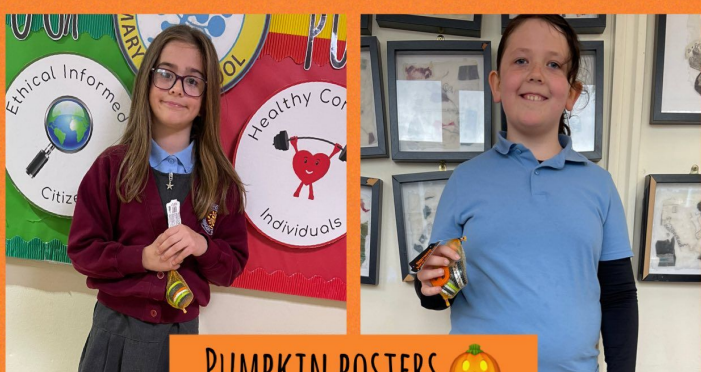
PUMPKIN POSTERS 🎃

Llongyfarchiadau to the winners of the Friends of Whitchurch Primary pumpkin colouring and pumpkin carving competitions! Our School Council members had the difficult job of choosing from so many fantastic entries. Da iawn to everyone who took part!