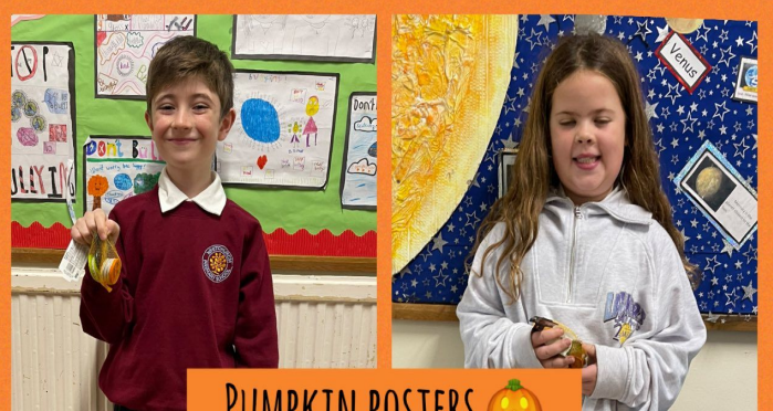
PUMPKIN POSTERS 🎃