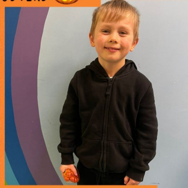
DA IAWN TO OUR COMPETITION WINNERS 🎃