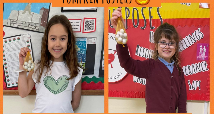
DA IAWN TO OUR COMPETITION WINNERS 🎃