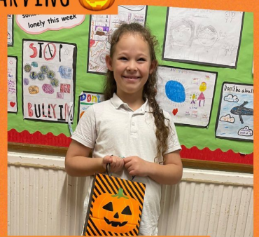
DA IAWN TO OUR COMPETITION WINNERS 🎃