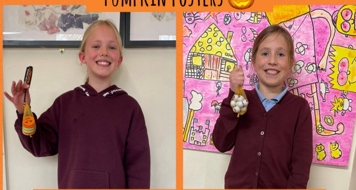
DA IAWN TO OUR COMPETITION WINNERS 🎃